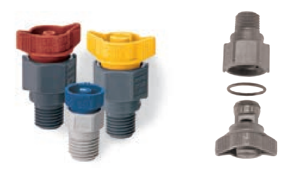
ProMax® QuickJet® nozzles feature a quick-connect design that decreases maintenance time and reduces costs. The nozzle body stays on the header and only the spray tips are replaced. Spray tips are removed and installed by hand and spray patterns are automatically aligned.