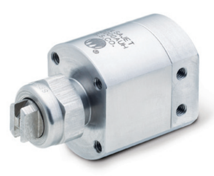
PulsaJet hydraulic automatic spray nozzles help eliminate the need for costly compressed air and deliver egg wash to the target with high efficiency