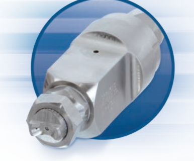
Four 1/4JAUCO automatic air atomizing nozzles are used to cover the entire width of the conveyor.