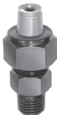
Typical UniJet spray nozzle assembly with 23945 tip

UniJet 23945 spray nozzles , frequently used in carcass chilling, provide a wide-angle, hollow-cone spray pattern with a thick annulus.