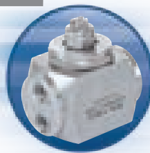
AA10000AUH-72400 heated PulsaJet® nozzle applies the butter to the dough.

Precision Spray Control (PSC) involves turning nozzles on and off very quickly to control flow rate. This cycling is so fast that the flow often appears to be constant. With traditional nozzles, flow rate adjustments require a change in liquid pressure, which also changes the nozzle's spray angle/coverage and drop size. With PSC, pressure remains constant enabling flow rate changes without changes in spray performance. PSC requires the use of electrically-actuated spray nozzles and an AutoJet spray controller.