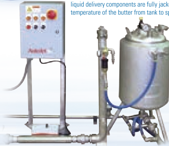
10 gallon (38 liter) pressure tank is fully jacketed and is fitted with an agitator.

AccuCoat Heated Spray System includes a Spray Control Panel for convenient control of spray pressure and cycle times along with a separate Heater Control Panel to ensure proper liquid temperature. All liquid delivery components are fully jacketed to maintain consistent temperature of the butter from tank to spray target.