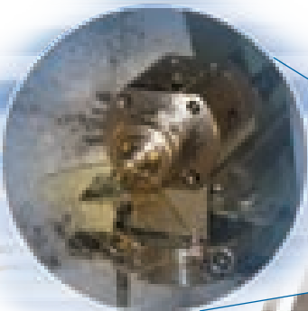
Pulsajet Automatic Nozzle

The automated spray system utilizes Precision Spray Control (PSC) to precisely control the volume of olive oil applied. PSC enables hydraulic nozzles to produce very low application rates by adjusting the electrically-actuated nozzles. The system also adjusts automatically for variations in line speed, completely eliminating over- and under-application of the oil.