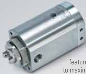
AIR ATOMIZING PULSAJET® NOZZLES FOR PANELSPRAY-RS

The nozzles produce very small drops and feature a wide turndown ratio to maximize operating flexibility.