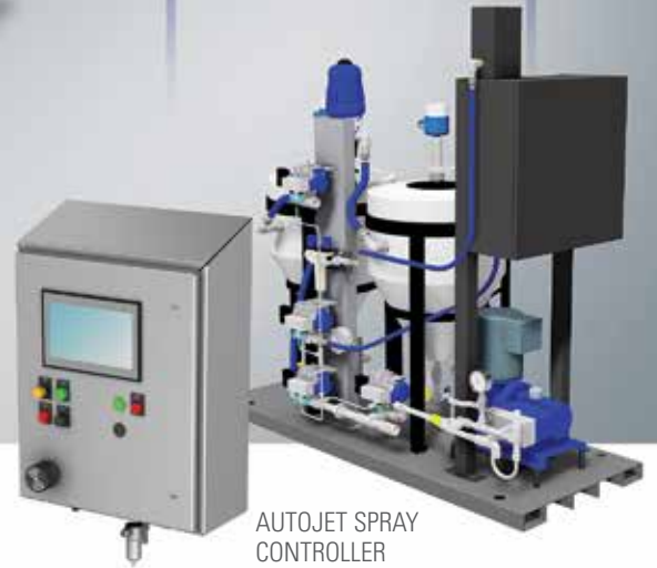
AUTOJET SPRAY CONTROLLER WITH TOUCH SCREEN HMI

The PanelSpray-NM system, controlled by an AutoJet® spray controller with convenient touch screen HMI, is easily integrated with existing plant equipment. Marking ink is fed from a tote into a concentrate tank, diluted to the specified concentration and stored in a day tank. The ink is pumped to automatic spray nozzles equipped with clean-out needles to ensure clog-free performance. Nozzles are arranged in headers to produce any nail line pattern required by your customers. Single or double pass marking patterns are possible. Ink is recirculated from the spray nozzles to the day tank continuously to maintain a consistent mixture and keep solids in suspension.