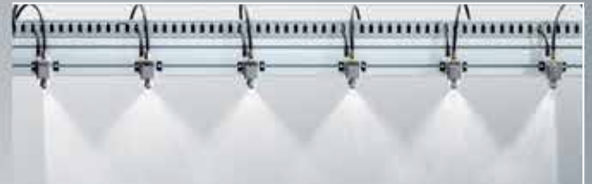
PULSAJET® SPRAY HEADER

Pulsajet headers, used in both the PanelSpray-RA and PanelSpray-MS systems, are fabricated to meet press specifications. Header length, placement and nozzle placement on the header are customized to ensure accurate distribution across mats, belts or cauls of any width.