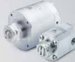
PULSAJET HYDRAULIC NOZZLES

Pulsajet headers, used in both the PanelSpray-RA and PanelSpray-MS systems, are fabricated to meet press specifications. Header length, placement and nozzle placement on the header are customized to ensure accurate distribution across mats, belts or cauls of any width.