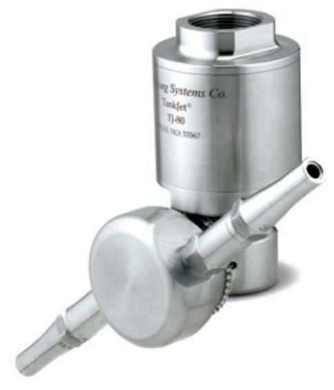
TankJet 80 tank cleaner provides powerful, reliable cleaning of tanks up to 50' (15.2 m) in diameter. Available with two or three nozzles.