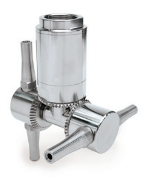
TankJet 65 tank cleaner provides powerful, reliable cleaning of tanks up to 40' (12.2 m) in diameter. Four-nozzle hub provides tight cleaning pattern and fast cycle times. Available in high-temperature version.