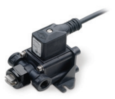
AA250AUH electrically-actuated hydraulic spray nozzles provide consistent lubricant application on the foam prior to die-cutting.