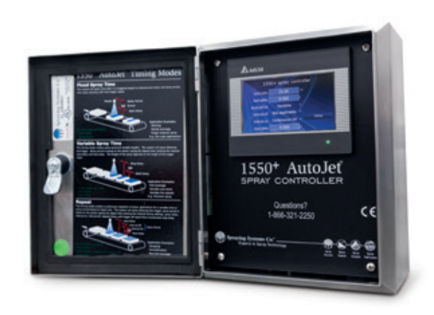
AutoJet Model 1550+ Spray Control Panel provides complete automated spray control of nozzles to ensure precise and accurate placement of lubricant with minimal waste. The system ensures proper flow and eliminates uneven lubricant application.