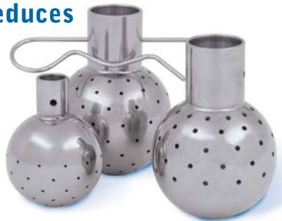
63225 Fixed Spray Balls

Designed to increase cleaning impact up to four times greater than conventional rotating nozzles, the 63225 Spray Balls are excellent for cleaning, sanitizing and foaming applications in both containers and equipment.