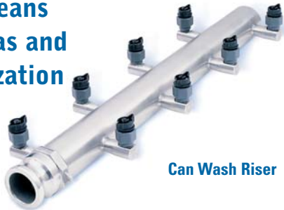
Can Wash Riser

Narrow angle nozzles and optimal nozzle spacing allow the spray to effectively penetrate the conveyor mat without knocking over the cans. This style of riser can also be designed to work with hollow cone nozzles in a pasteurization process to ensure a uniform distribution of liquid over the entire conveyor width.