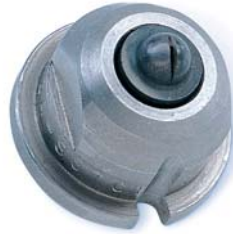
Can Coating Tip

Our new Can Coating Tip sprays a patented distribution pattern that gives superior strand weights from the top to the bottom of the can but uses less coating material than competitive nozzles. With coating being the second largest operating expense following aluminum, this simple change in nozzle design can make a significant impact on your bottom line. Cuts in the orifice create an asymmetrical spray distribution that is calibrated to the shape of a 2-piece, 12 oz. or 16 oz., 2.4 inch (61 mm) diameter beverage can. Coating is applied exactly where it is needed significantly reducing can weights.