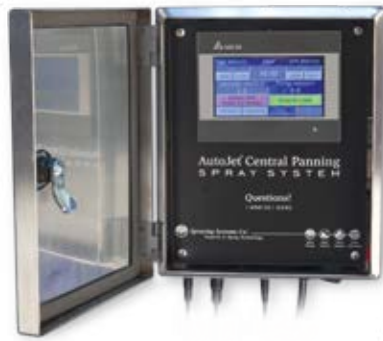
Control Panel with Touch Screen HMI