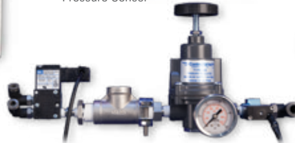
Air Control Assembly