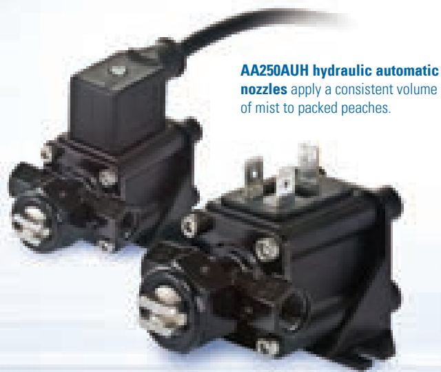
AA250AUH hydraulic automatic nozzles apply a consistent volume of mist to packed peaches.