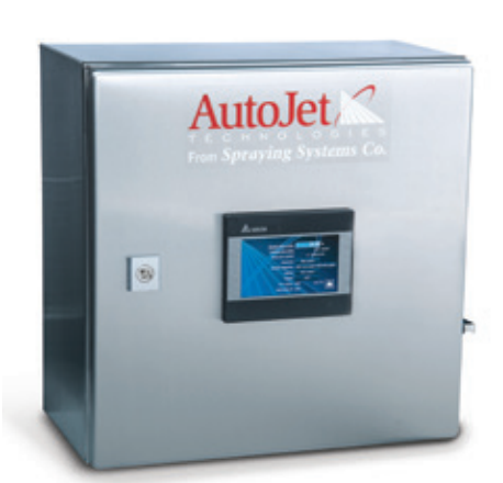
AutoJet 2008+ Spray Control Panel provides easy control of nozzles and cycles PulsaJet nozzles up to 50% faster.