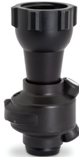
TankJet D41892 tank cleaning nozzle