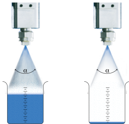
Duty Cycle 5%