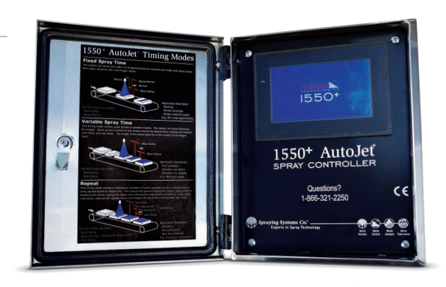
AutoJet spray controllers provide precise control of flow rate and spray timing, eliminating overspray and wasted release agent.