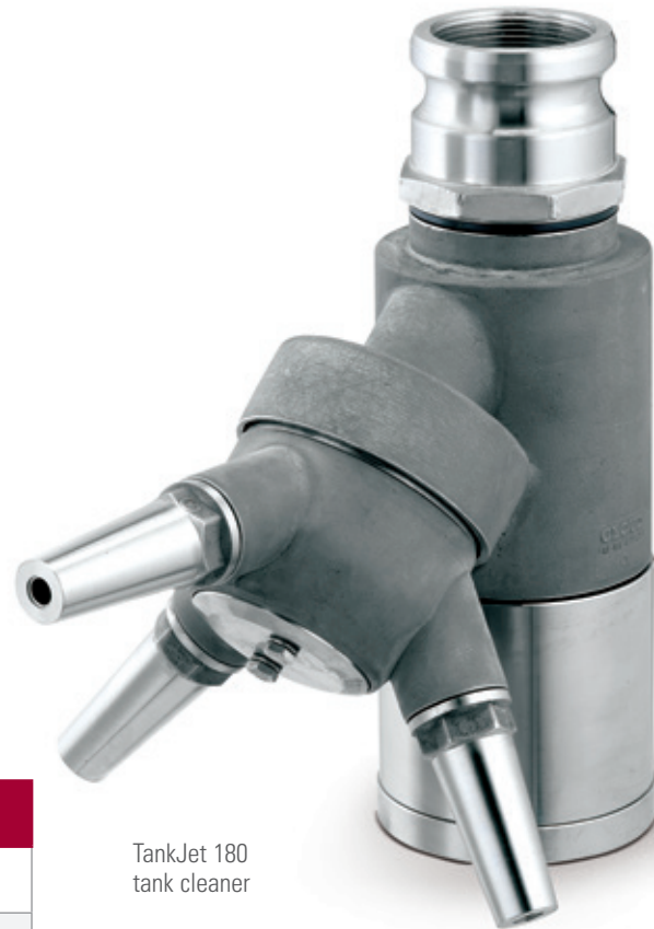
TankJet 180 tank cleaner