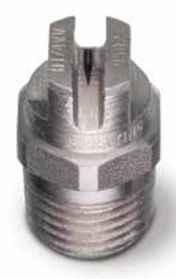
VeeJet® nozzles produce a thin, tapered-edge, rectangular spray pattern with medium sized drops and higher impact. Positioned to the side of the rail cars, the higher impact spray penetrates the falling iron ore and provides effective dust control.

FullJet® nozzles produce a solid coneshaped spray pattern with medium to large drops that are frequently used for dust control systems. Positioned above the rail cars, the FullJet nozzles cover the dumping area with the correct size drops for effective containment of the dust.