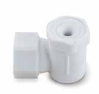
AP and AP-W 1/4" to 3/8" female conn.