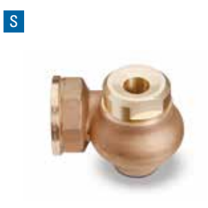
CRC 1-1/4" to 4" female conn. Two-piece cast-type