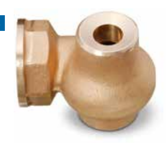
CX 1" to 2-1/2" female conn. Slope-bottom design One-piece cast-type