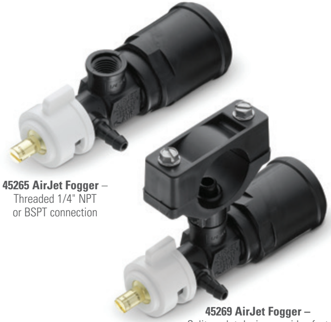
45265 AirJet Fogger – Threaded 1/4" NPT or BSPT connection