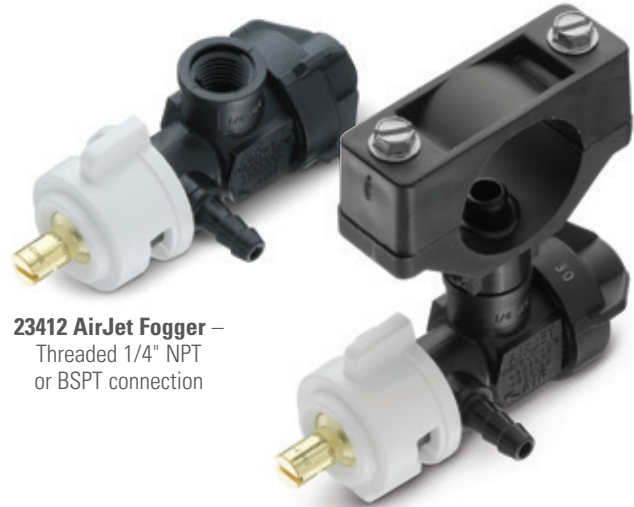
23412 AirJet Fogger – Threaded 1/4" NPT or BSPT connection