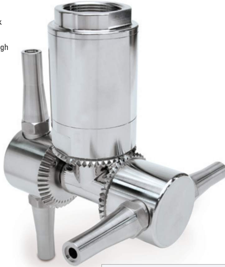
TankJet 65 tank cleaner