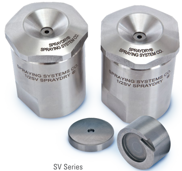
SV Series SprayDry® Nozzles