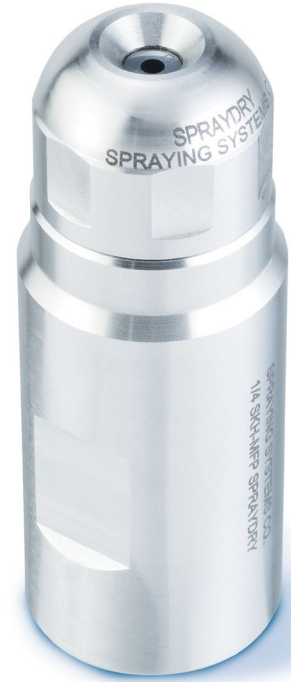
SK Series SprayDry® Nozzles