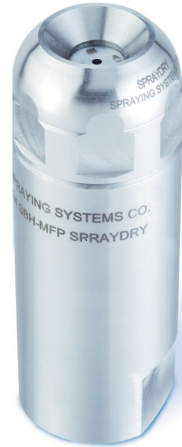
SB Series SprayDry® Nozzles