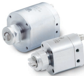
Eight Pulsajet® electrically-actuated spray nozzles cover the width of the conveyor.

PanelSpray MS System uses an AutoJet® Model 2250+ spray controller to automatically adjust the amount of binder fluid applied to the fiberglass based on line speed.