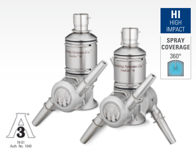
This unit meets the requirements of 3-A Sanitary Standard 78-01 Spray Cleaning Devices Intended to Remain in Place.