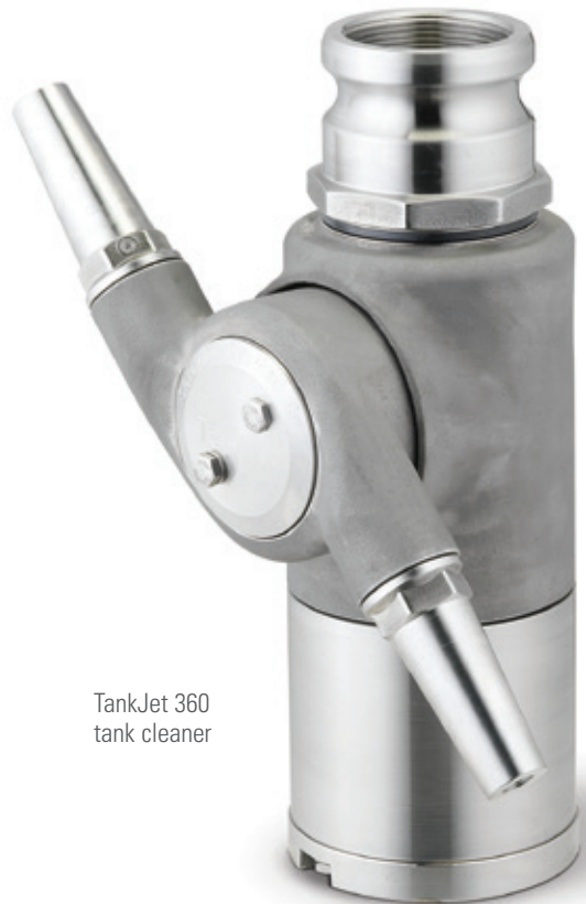
TankJet 360 tank cleaner