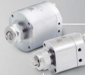
PULSAJET HYDRAULIC NOZZLES

PulsaJet headers, used in both the PanelSpray-RA and PanelSpray-MS systems, are fabricated to meet press specifications. Header length, placement and nozzles placement on the header are customized to ensure accurate distribution across mats, belts or cauls.