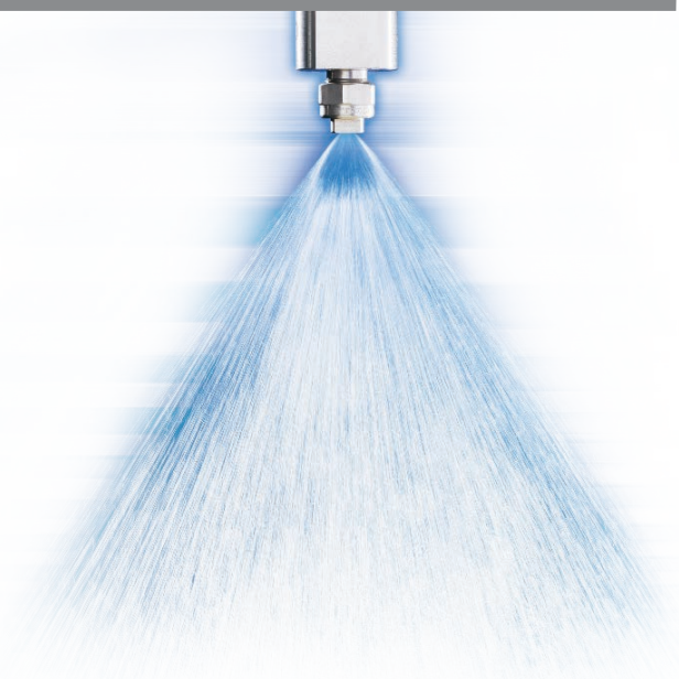
A Pulsajet® Nozzle applies the preservative uniformly with minimal waste.

An AutoJet® Model 1550 Modular Spray System provides easy control of nozzles.