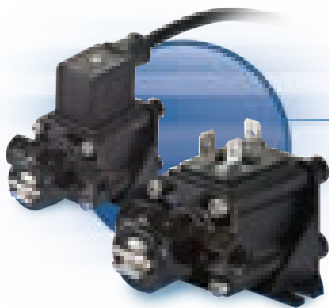
AA250AUH Automatic Spray Nozzles

Spraying Systems Co.'s solution consisted of an AutoJet® Model 1550 Modular Spray System and a header equipped with six AA250AUH automatic spray nozzles. The spray header applies the release agent as a thin, uniform film across the entire width of the stainless steel conveyor. The AutoJet system uses Precision Spray Control (PSC) to produce very low flow rates. As line speed changes, operators can easily adjust the flow rate of the nozzles without changing pressure – maintaining consistent spray coverage and drop size. And because the AA250AUH nozzles use only low pressure hydraulic atomization, mist and overspray are avoided.