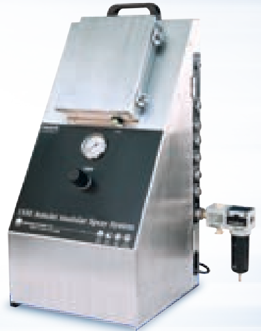
AutoJet Model 1550 Modular Spray System provides precise on/off automatic control of nozzles.

Six AA250AUH automatic spray nozzles coat the drying conveyor to prevent rubber crumbs from sticking.