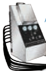
AutoJet Model 1550 Modular Spray System