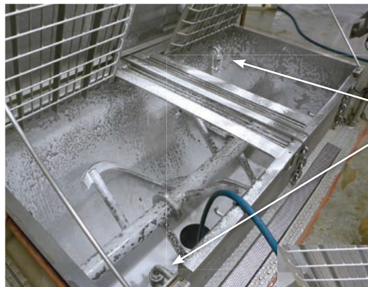
Ribbon blender being cleaned

Spraying Systems Co.'s TankJet® 75 tank cleaner solved the customer's problem. Two TankJet 75 units, positioned in opposite corners of the blender, provide effective cleaning. Shadowing, caused by the ribbon blade and other internal obstructions, is overcome by the use of two tank cleaners that ensure all surfaces are thoroughly cleaned. Hot water is pumped to the tank cleaners at 50 psi (3.4 bar) with a flow rate of 8 gpm (30 lpm). The powerful impact of the water jets ensures repeatable results with every cleaning cycle.