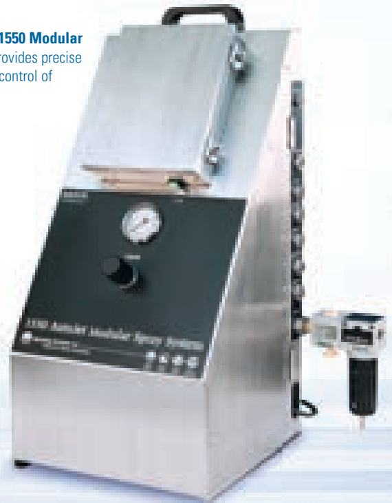
AutoJet Model 1550 Modular Spray System provides precise on/off automatic control of nozzles.