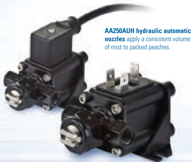
AA250AUH hydraulic automatic nozzles apply a consistent volume of mist to packed peaches.