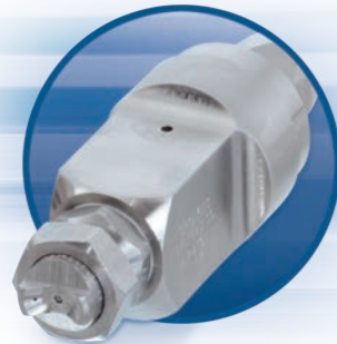
Four 1/4JAUCO automatic air atomizing nozzles are used to cover the entire width of the conveyor.