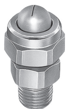
UniJet flat spray blow-off assembly