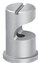
UniJet TK nozzle spray tip