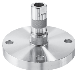
Adjustable raised face flange for tanks with 150# flange connections 2", 3" and 4" sizes