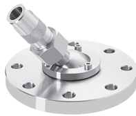
Ball joint assembly 4" and 6" Adjust the ball swivel to change the angle of spray head as much as 60°