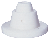
Tank wash adapter for tanks with 2" to 4" inlet sizes Celcon® (acetal) with 304 Stainless Steel screws resists corrosion