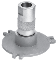
Adjustable three-prong flange For use with AA090 or AA190 tank washers