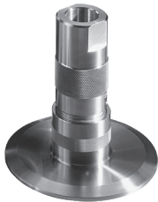
Adjustable flange with Tri-Clamp® fitting 2-1/2", 3", 4" and 6" sizes