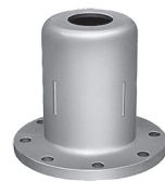
4" to 12" sizes Flange connection