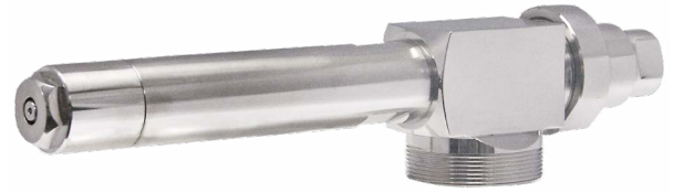
46915 Fluid Bed Coater Nozzle