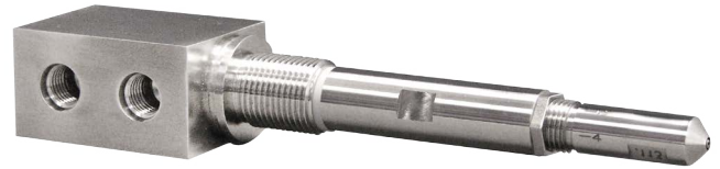
54057 Fluid Bed Coater Nozzle