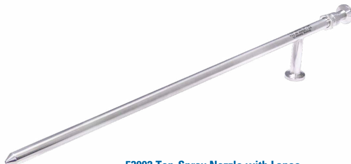
53992 Top-Spray Nozzle with Lance