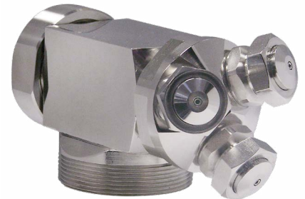
46920 Cluster Head Top-Spray Granulation Nozzle