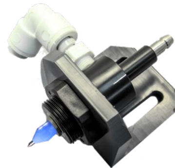
AutoJet Single-Point Continuous Nozzle