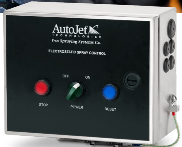
AutoJet Spray Controller