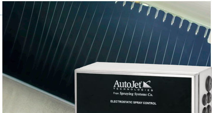
Manifold Nozzles In Use