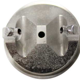
P-Series Air Cap

Results after spraying OPADRY®. The P-Series cap is pictured after being sprayed for twice as long as the standard air cap.