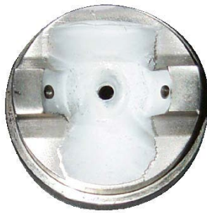
Standard Air Cap

The patented P-Series Anti Bearding Spray Set-up allows users to run their spray operations from 8 to 10 times longer than with standard set-ups* with minimal nozzle build-up, greatly reducing maintenance downtime due to cleaning or clogging.